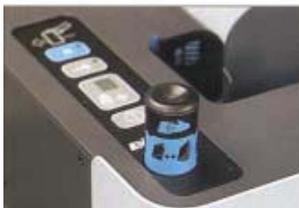
The automatic thickness adjustment can be switched to manual for specific documents like booklets or NCR forms.