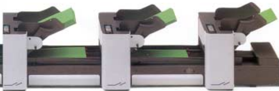
The four-station configuration.

The high performance is not only the result of the high speed (up to 4000 cycles per hour) but is also achieved by easy set up and maximum up-time.