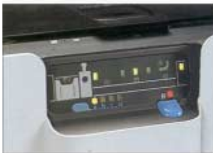
Paper flow is monitored throughout the unit.