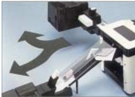
The SI78 has two exits for mail batching or sorting the envelopes depending on thickness. Online metering is also possible on both exits.