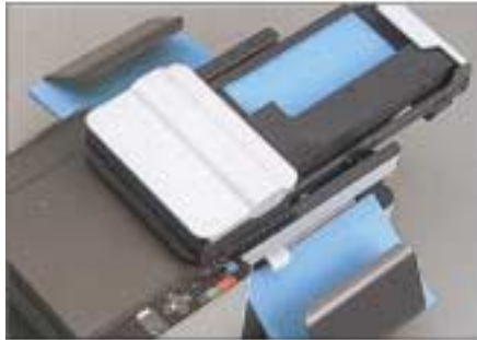
After Reading, the documents are inserted or diverted into trays for sorting or security.