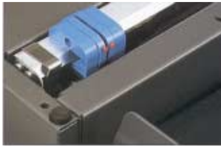
Two high-performance reading heads to verify mark accuracy.

For instance, imagine a bank's customer receiving another person's account statement along with his own, or a company receiving someone else's invoice with a lower price! The Neopost SI78 with OMR makes these scenarios virtually impossible.